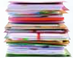
File Folders and Office Paper (all colors)