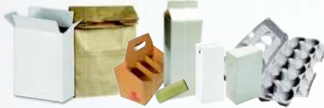
Boxboard and Paper Cartons (dry-food boxes, cores, paper bags, egg, milk, and juice cartons)