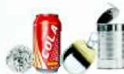
Metal and Food Cans (aluminum, tin, foil)