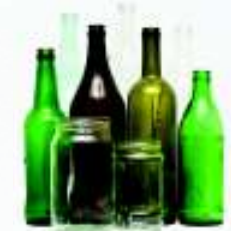
Glass Bottles (food jars, beverage)