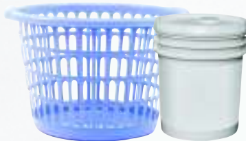
Large Rigid Plastics (5-gallon pails, laundry baskets)