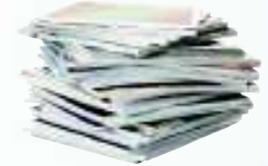
Magazines and Phone Books (catalogs, soft cover books)