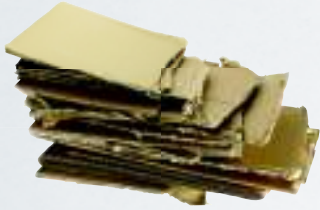
Corrugated Cardboard (wavy center layer)