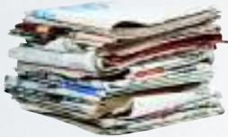
Newspaper (all sections, inserts)