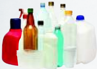
Plastic Containers (#1-#7)